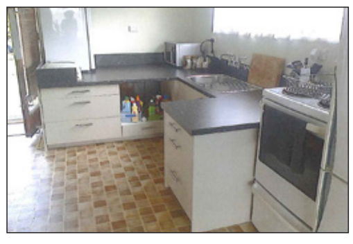
Tim's kitchen now.